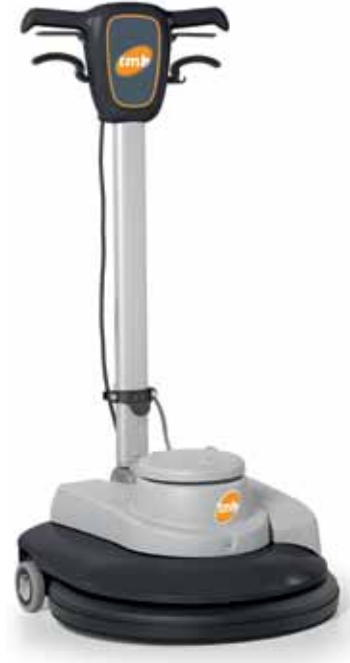
T UHS 1500 V